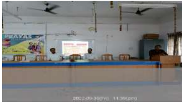
J . Photographs of the programme: